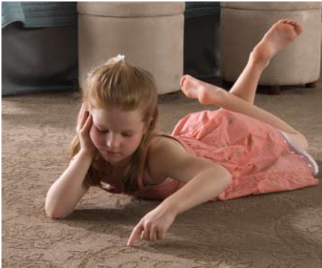
Carpet with SoftBac® Platinum

I want a floor that gives me everything I could ever want for a beautiful and lasting foundation.